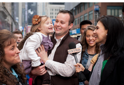
Meet our Contest Winners